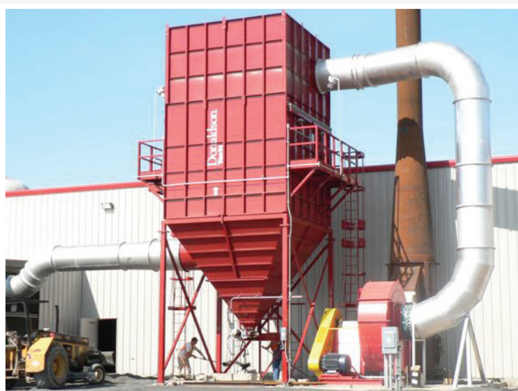
MB - Glass