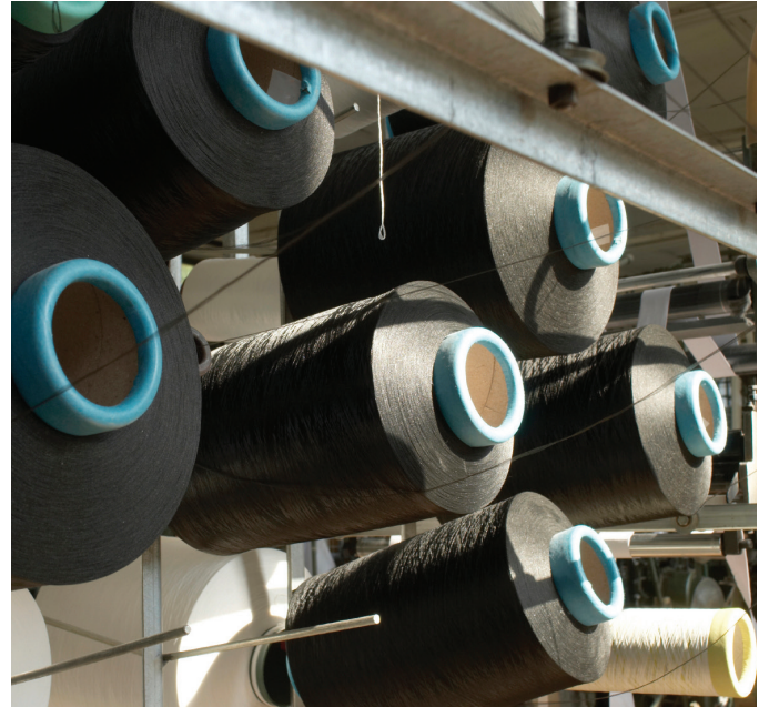
Ultra-Web SB pleated bag filters maintain lower pressure drop across the baghouse in the Karastan rug factory, helping to save energy and keep production running smoothly.

SOLUTION: Donaldson Torit Ultra-Web SB pleated bag filters. The combination of Ultra-Web nanofibers and wider pleat spacing allows effective pulse cleaning, achieves stable pressure drop (2.25 in of H 2 O/57.2 mm of H 2 O), & attains at least twice the filter life.