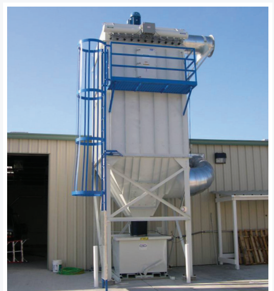
FS - Wood