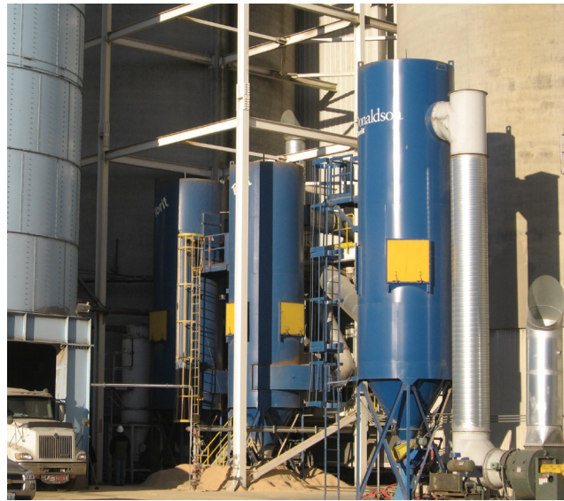
RF - Grain Terminal