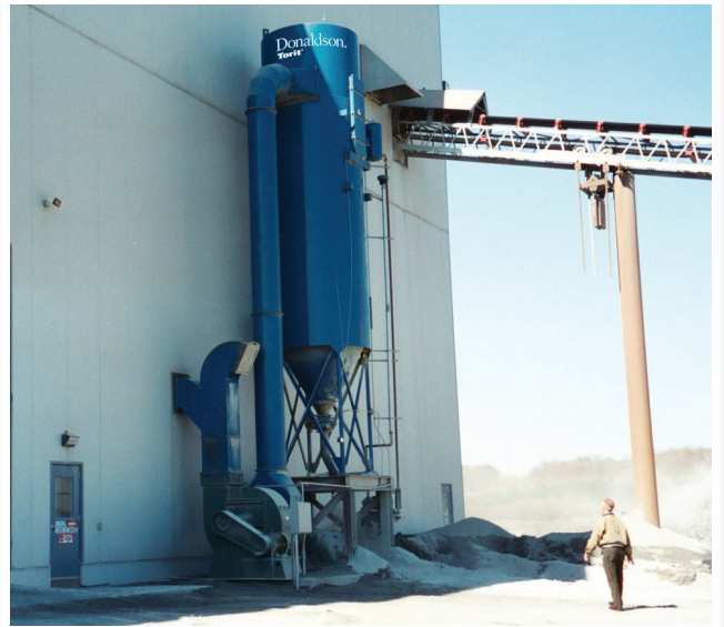
RF - Quarry